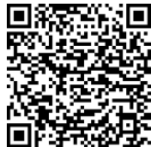
Course selection sheet

Graduate Diploma in Creativity (Digital Media)